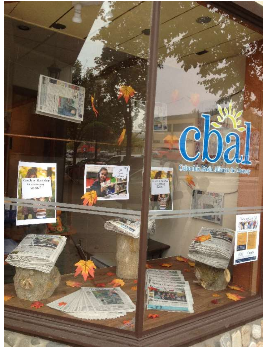
CBAL's Trail office

CBAL staff members are very excited to have established learning hubs and storefront services in the communities of Nelson, Creston, Cranbrook, Fernie, Nakusp, Salmo, Valemount, Invermere, Golden, Kimberley, and Trail.