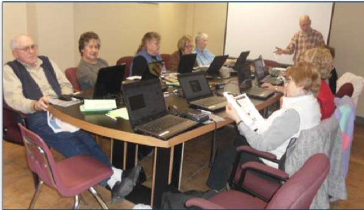
Seniors' Computer Workshop

On Making Connections: “This course was very valuable to my family. I discovered and re-discovered strategies to make learning and school more fun. I highly recommend any family to come to this course to learn and share.”