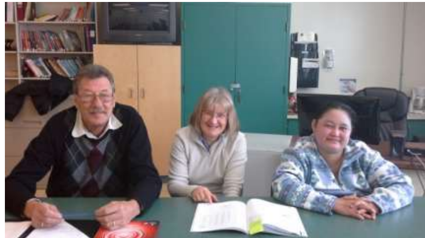
Senior program participants

“I am writing to thank you for giving me the opportunity to re-educate myself on the computer. I have been a computer user for many years but like many seniors, I have gotten lost in all of the new technology. I feel that our village, Nakusp, is very fortunate to have this service and all of the volunteers who give their time and energy to make this program such a success.”