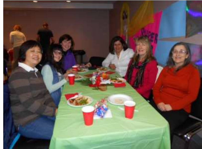
ESL field trip and pot luck Christmas party

“In our ESL class we have a new mother from Korea, a businesswoman from Germany, a Polish housewife who has been in Canada for 16 years, a man from Rwanda who has been here for 12 years looking to obtain citizenship and a Chinese woman new to the country who has just purchased a restaurant with her husband. This makes for a wonderful and diverse class!”