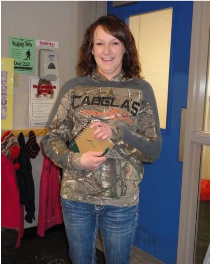
Young Parent Education Program (YPEP) participant

“Learners took part in ‘Student for a Day’ (at College of the Rockies) and the responses were phenomenal with at least 3 deciding on career choices – awesome and wonderful were the words describing their experiences.”