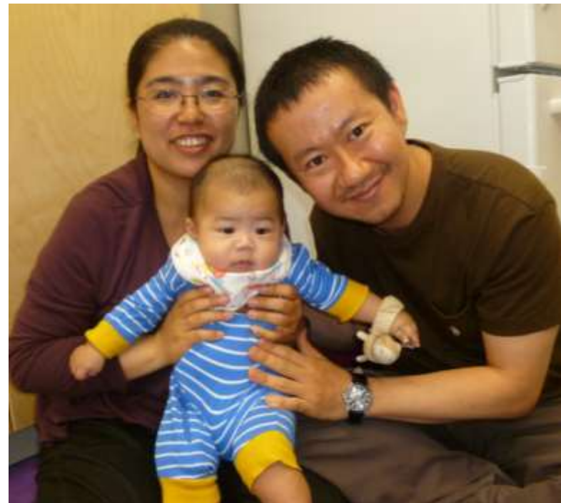
ESL family at Mother Goose

The Mother Goose program is incredibly successful in Golden – the attendance is high and feedback is positive. The children show progress with language and social development and parents have formed bonds with each other. The facilitator says "a number of ESL families have been attending and the parents thanked her for presenting songs that helped them learn simple English words to share with their children at home."