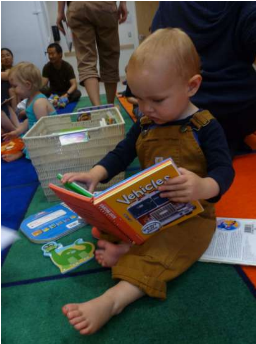
Baby Goose program participant

A Baby Goose parent said "I need this program to stay sane! Thank you so much. The program makes me a much better mom and far more confident, relieving a lot of anxiety with the knowledge gained."